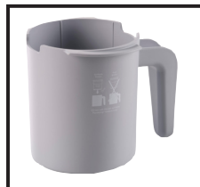
Pacojet Synthetic Protective Outer Beaker